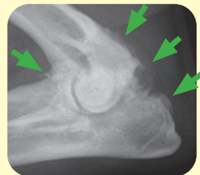
Arthritic elbow joint in a dog with lots of "fluffy" new bone (yellow arrows) around the joint, indicative of marked arthritis.