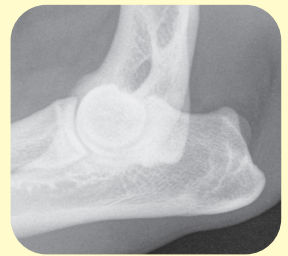
X-ray of a normal elbow joint

Radiography is commonly used to investigate joint problems.