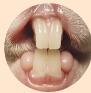
Healthy incisor teeth should normally meet – as above

The good news is that feeding the correct diet, as outlined above, can go a long way to avoiding most dental problems in rabbits. For more advice, please have a chat to our team who will be very happy to advise you!