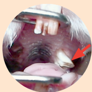
Overgrown cheek teeth (arrowed) are sharp and can lacerate the soft tissues. Symptoms include saliva wetting around the mouth, decreased appetite and weight loss