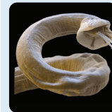
Electron micrograph of an adult lungworm (You won't see them as they live in the lungs!)