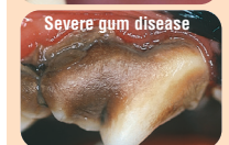
Severe gum disease