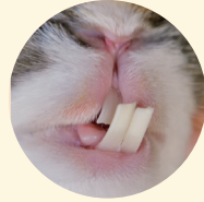
Misaligned and overgrown incisor (front) teeth