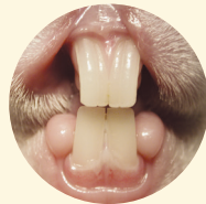
Healthy incisor teeth should normally meet – as above